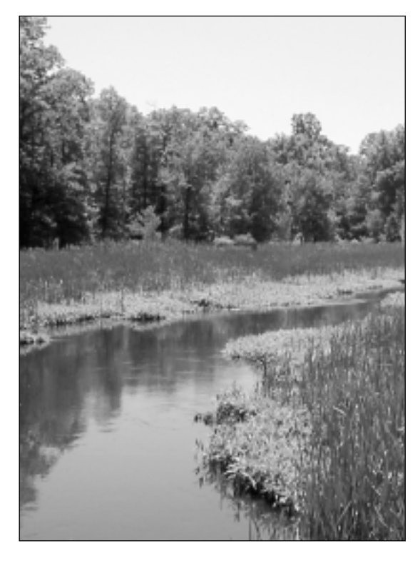
The Passaic River as it prepares to leave the Watershed near White Bridge Road in Long Hill Township.

From April 20 - May 19, 2002 bring this passport with you every time you visit one of the sites listed on the event calendar and they will stamp it for you. Submit your passport (with at least two stamps) to Great Swamp Watershed Association and you'll be entered to win! Prize listing and rules are on this sheet.