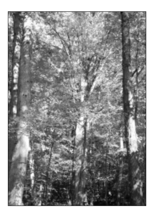
Majestic mature hardwood trees abound at the GSWA Conservation Area in Harding Township. Sections of the tract were too wet to be farmed and thus were never cleared.